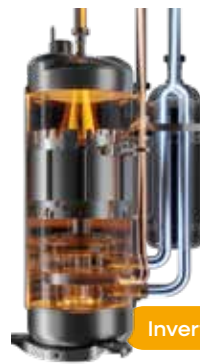
Inverter driven compressor

Central-Elios' advanced Inverter technology brings temperature control to the next level by allowing the compressor to operate at variable speeds, adjusting its output to precisely meet heating or cooling needs. For home and business owners, this means less energy use, extended system life, and quieter, more consistent performance.