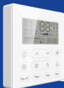
Compatible controller – Model KJRSAALW1 (Wi-Fi enabled)

Whether you choose the new touchscreen thermostat or compatible controller, you can trust your Elios contractor to help you choose the model best suited to your needs.