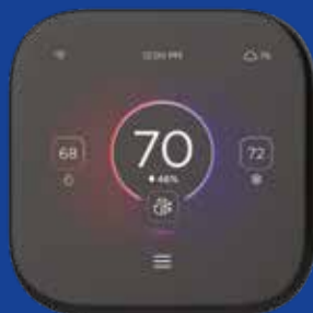
Touchscreen thermostat – Model ST1S42RW1 (Wi-Fi enabled)